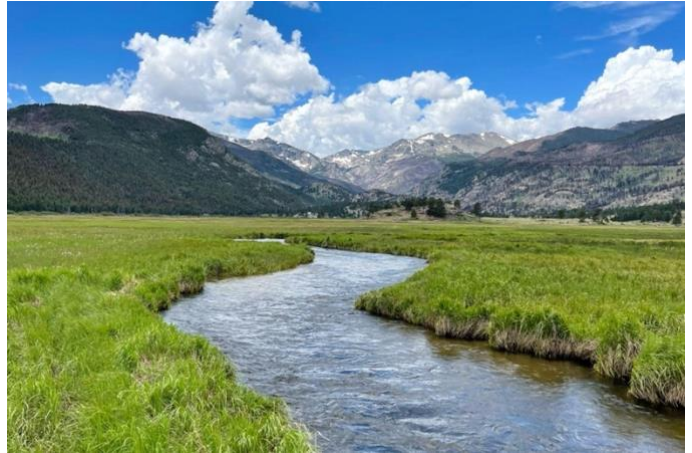
The Big Thompson River meandering through Moraine Park in Rocky Mountain National Park