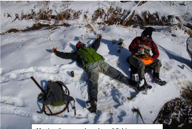
Having fun on a slow day of fishing

Winter is a long season in our neck of the woods. With the possibility of snow covering the ground for 4 months out of the year, the fair-weather fly fisherman misses out on a lot of time that could be spent on the water. I have always found fishing during these cold months to be an enjoyable time between the scenery, quietness, challenge, and reward. Without the right gear and a willingness to get a little cold though, winter trout fishing can be fairly miserable. Here are a few tips to get you started and buffer the potential misery of winter trout fishing.