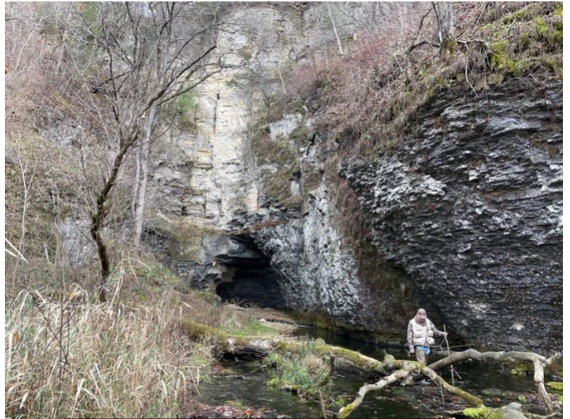
Cave at the headwaters of Coldwater Creek

the afternoon on dry flies, but the hatch wasn't as big as the two previous days, and I got most of my fish on nymphs. Today, it was almost all browns, including some big ones. Around 3 pm I was tightlining a #16 beadhead nymph on 6x tippet through the fast water at the head of a pool with my Tenkara rod. A large fish took it, and after convincing myself to be patient, I babied it over to the bank and netted it. A perfect bookend to my first day of the 2023 season when I got too impatient with a large fish and it broke me off. No doubt I will have to learn the same lesson again next Spring!