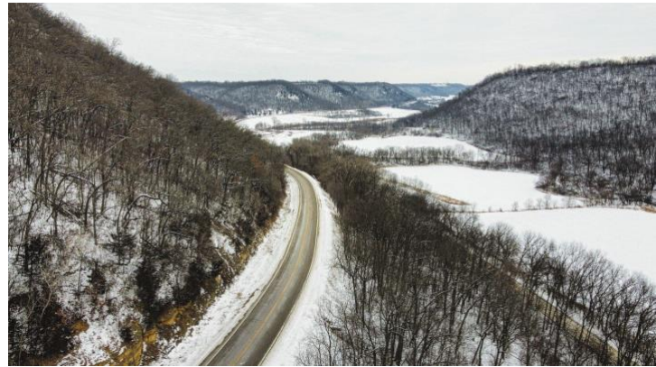
The scenery of a winter drive in SE MN is hard to beat